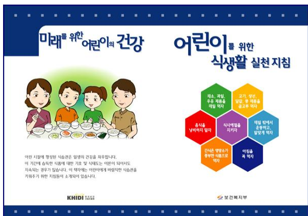
Figure 3. Dietary action guide booklet for children