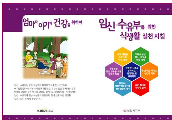
Figure 2. Dietary action guide booklet for pregnant and lactating women