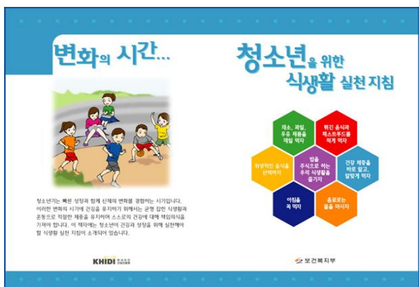
Figure 4. Dietary action guide booklet for adolescents