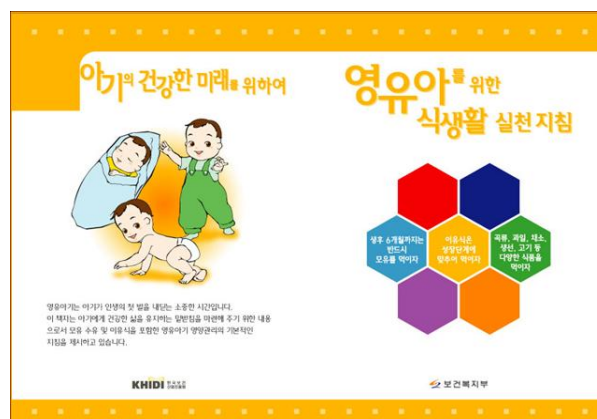
Figure 1. Dietary action guide booklet for infants and toddlers