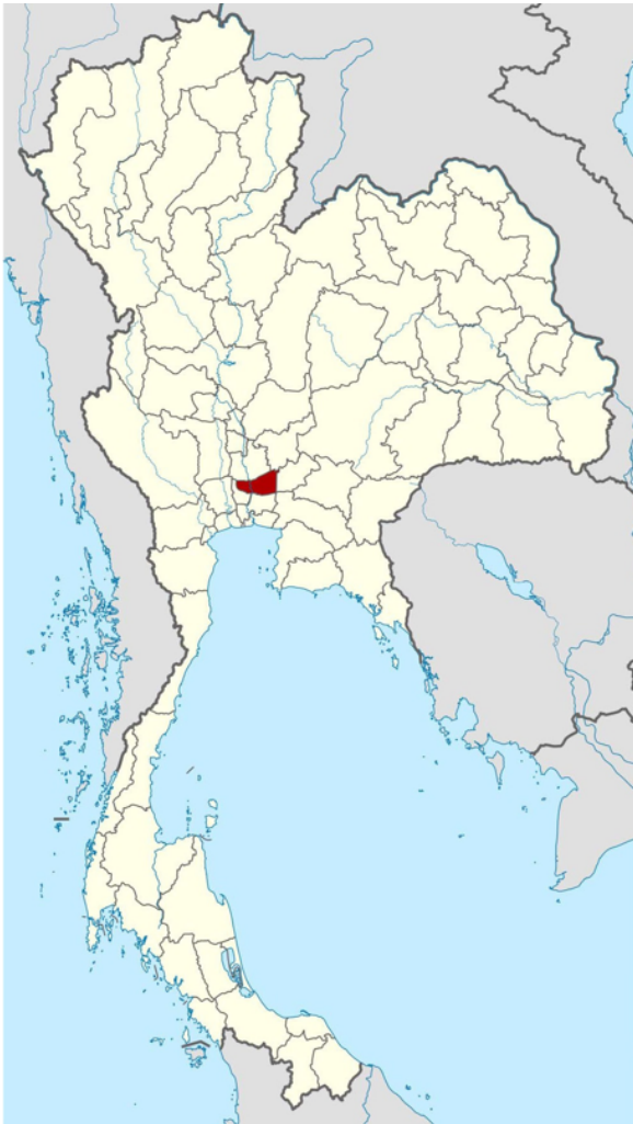
Figure 1. Map of Thailand highlighting Pathumthani Province. (Reference: Wikipedia, the free encyclopedia) 7

Thailand. The secondary objective was to identify possible concomitant nutrient inadequacies within an iron depletion state.