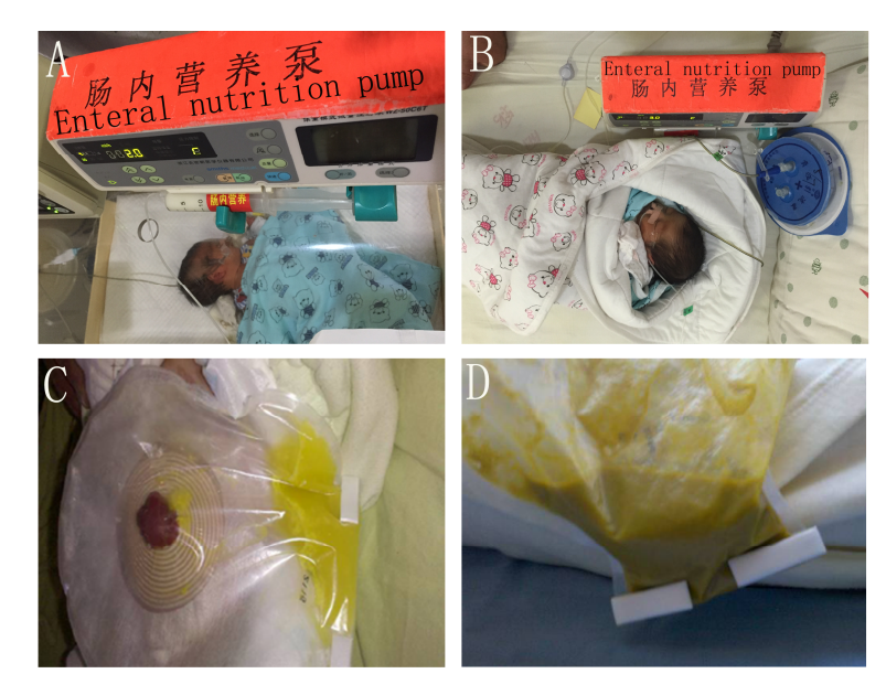
Figure 1. A. and B. Infants undergoing continuous nasogastric tube feeding. C. Fistulas of the intermittent oral feeding group. D. Fistulas of the continuous nasogastric tube feeding group.