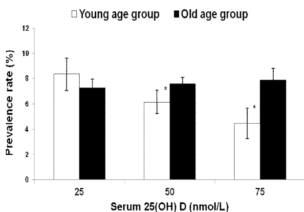
Figure 1. Adjusted prevalence rate (%) of diabetes mellitus by level of serum 25(OH)D by young and old age group in female subjects. * p < 0.01 compared with 25 nmol/L

†: age, gender, residence location, region, smoking status, drinking status, body mass index, regular exercise, and season