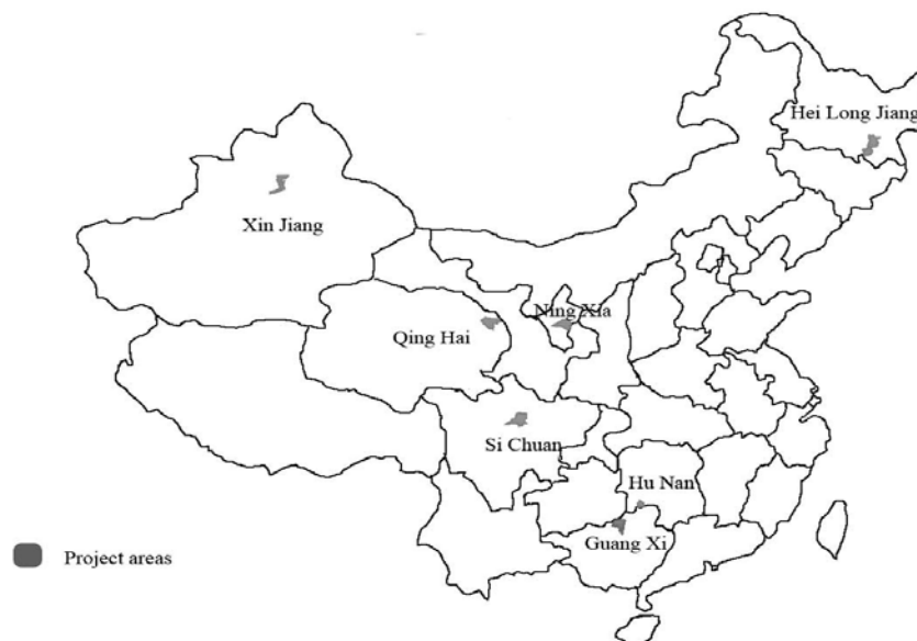
Figure 1. The sites of seven counties located in different regions of China.

Predominant breastfeeding rate below 6 months: this is the proportion of infants less than 6 months of age who are predominantly breastfed. The denominator is the