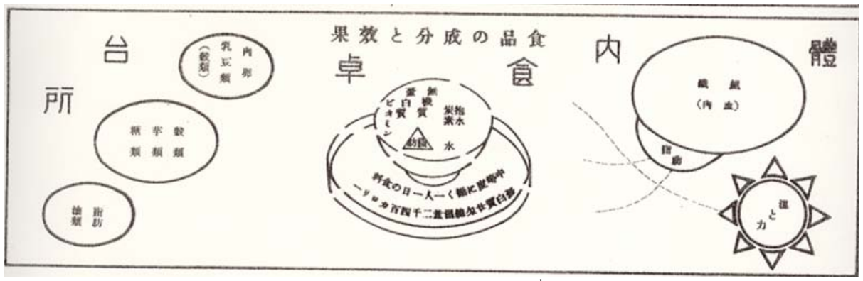
Figure 1. Integrated theory for improving public health through nutrition by Dr. Saiki<sup>1</sup>. Figure 1 illustrates the flow of food components, which starts from obtaining food items and cooking. Then, when we eat meals on the table, nutrients can be taken into one's body, which will bring physiological effects and improve one's health.

which permitted analysis of nutritional intake.