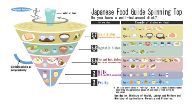
Figure 4. Japanese food guide spinning top

diseases cannot be achieved with narrowly focused programs, but requires an integrated approach such as that embodied in Shokuiku .