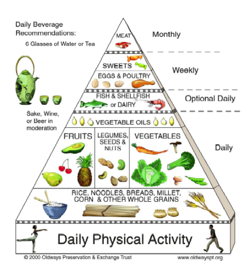
Figure 3. Traditional healthy Asian diet pyramid

The Traditional Healthy Asian Diet Pyramid